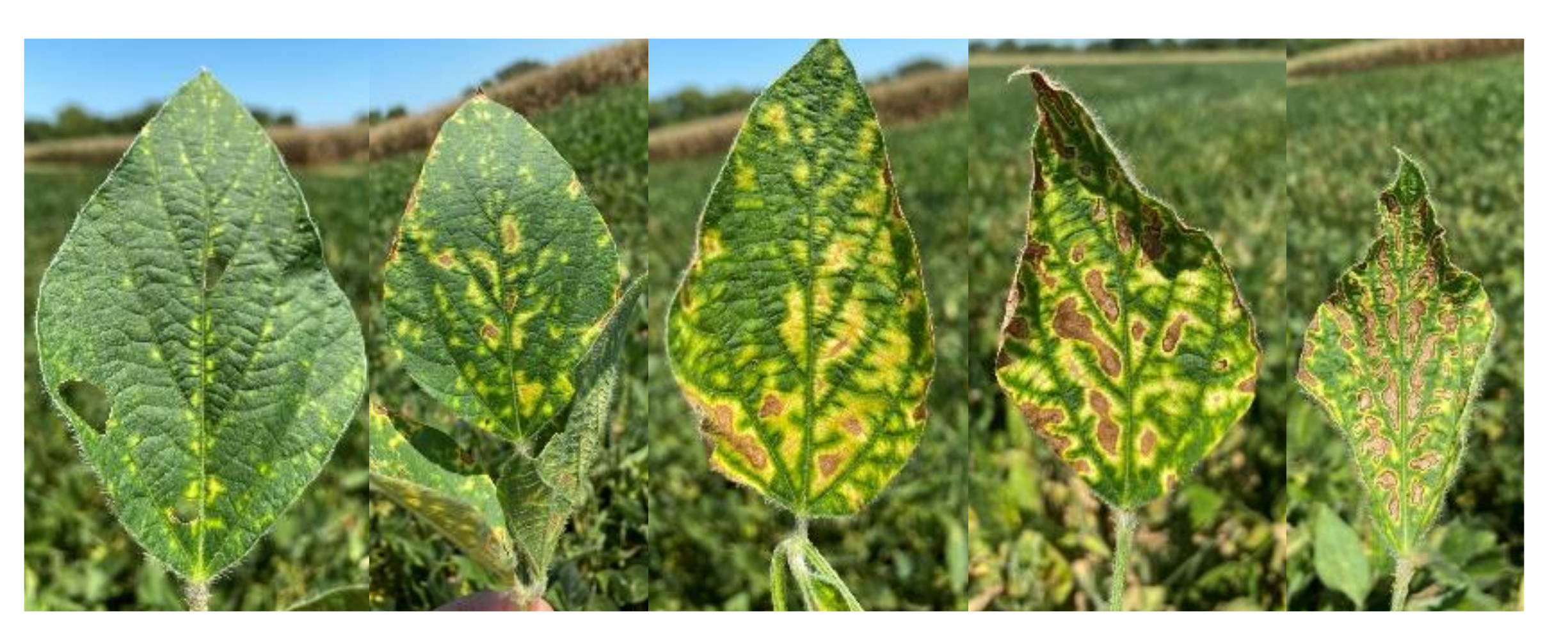
Fig. 1: Progression of SDS leaf chlorosis and necrosis.

Yield losses typically range from 5-15%, with highly infested fields reporting losses up to 100%.