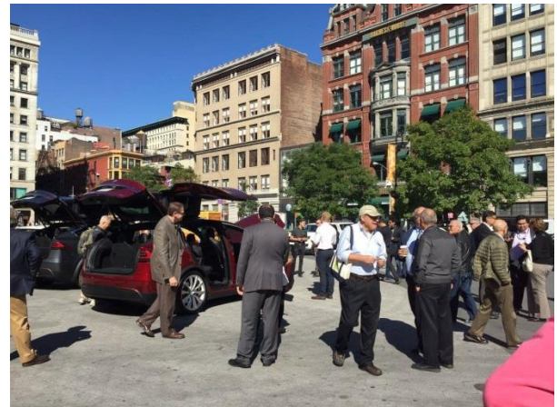
Empire Clean Vehicle Festival Partners and a Few Participants: